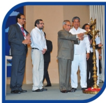
Efficient Water Management: Challenges and Opportunities