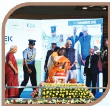
Water Security for Sustainable Development with Equity