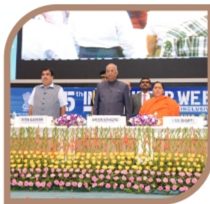
Water and Energy for Inclusive Growth