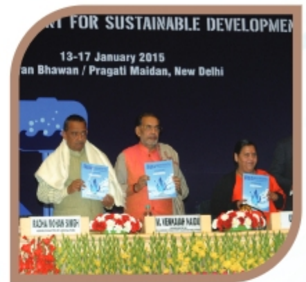
Water Management for Sustainable Development