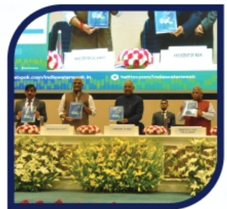
Water Cooperation – Coping with 21st Century Challenges