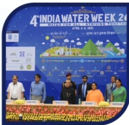
Water for All: Striving Together