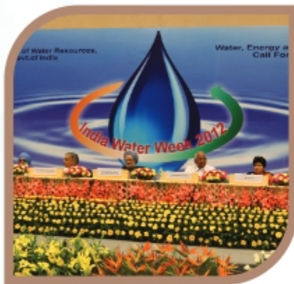
Water, Energy and Food Security: Call for Solutions